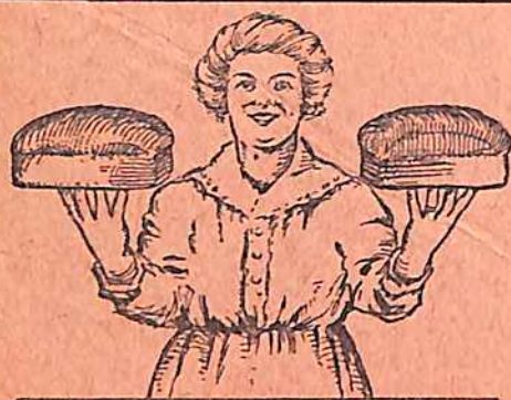
The loaf that stopped Mother baking.