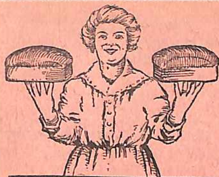
The loaf that stopped Mother baking.